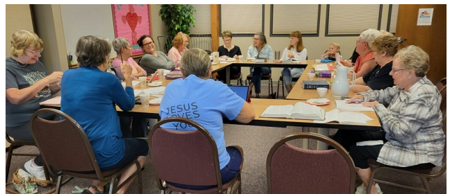
Thursday morning Women’s Bible study group

Oct. 29: Guest Speaker. This Is the Life: “The Sexton.”