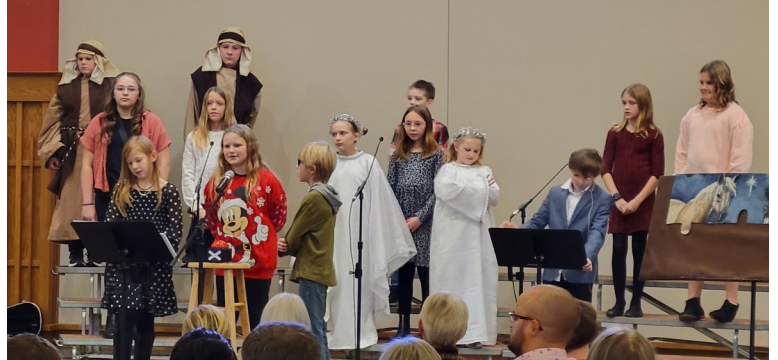
Grade 4-6 - "The Christmas Scavenger Hunt"