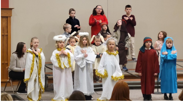
PreK-Grade 3 - "Silent Night, Holy Night"