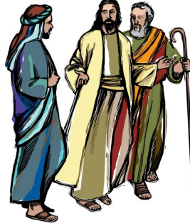
On the Road to Emmaus

Likewise, at the end of Luke's Gospel, the resurrected Christ meets two travelers on the road to Emmaus. Not recognizing Jesus, they tell our Lord about His own passion and death; the travelers think all this has led to a dead end, saying: "But we had hoped that he was the one to redeem Israel. Yes, and besides all this, it is now the third day since these things happened," (Luke 24:21).