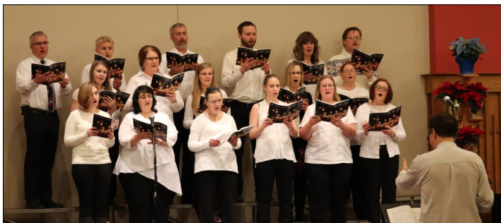
"The First Light" Christmas Cantata was held Dec. 19. during the midweek Advent worship service.