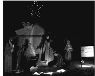
Grace Lutheran School Annual Display